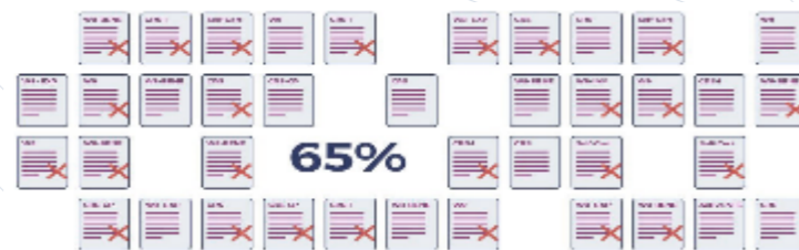
Error rate = risk of fine