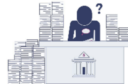
Lack of audit trail