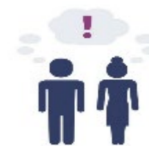
Customer experience suffers